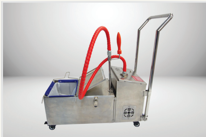
BATTERY OPERATED FRY OIL FILTER MACHINE